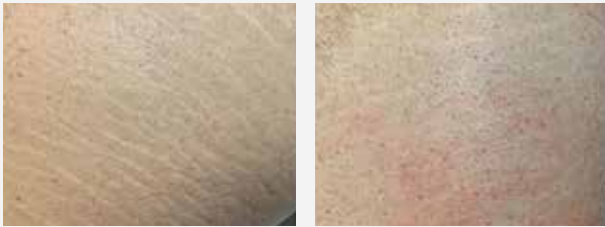
Age 35 - 6 sessions