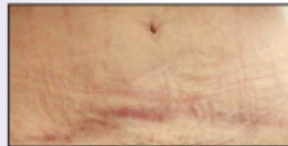
Scar seven weeks after two revive mn treatments

handpiece delivers up to 150 needle hits per second with adjustable frequency, which the company says is the secret behind its ability to effectively implant particulates and other substances into the dermis with precision. The device head adapts to the skin's surface, which helps it traverse and access difficult areas.