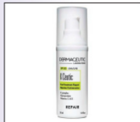
K Ceutic Post-Treatment Repair by Dermaceutic

Dermaceutic (Shannon, Ireland) will showcase their upgraded formulation of K Ceutic, a three-part topical complex designed to enhance healing and recovery after peels or laser therapy.