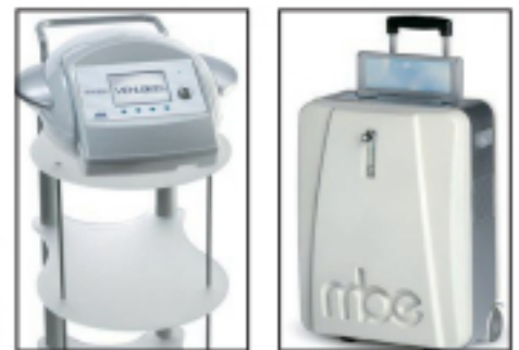
Venusian CO 2 Therapy and Oxy Xtra Med by Maya Beauty

A novel technology from Maya Beauty Engineering (Bologna, Italy), known as Gas Contouring, combines two gas-based treatments: Oxy Xtra Med and Venusian CO 2 Therapy. Oxy Xtra Med